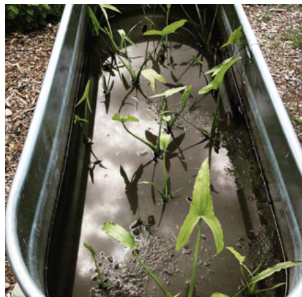
Planting wapato bulbs, a wild water potato. Bulbs sourced from the Native Foods Nursey in Oregon and Polly Olsen, the Burke Museum's Tribal Liason.

WITHOUT THE CROPS FROM THE FARM, THE EVENTS HELD BY THE WƏŁƏBʔALTX w INTELLECTUAL HOUSE WOULD NOT HAVE THE SAME UNDERSTANDING OF THE HARD WORK AND THE COMMUNITY THAT COMES FROM GROWING FOOD TOGETHER.