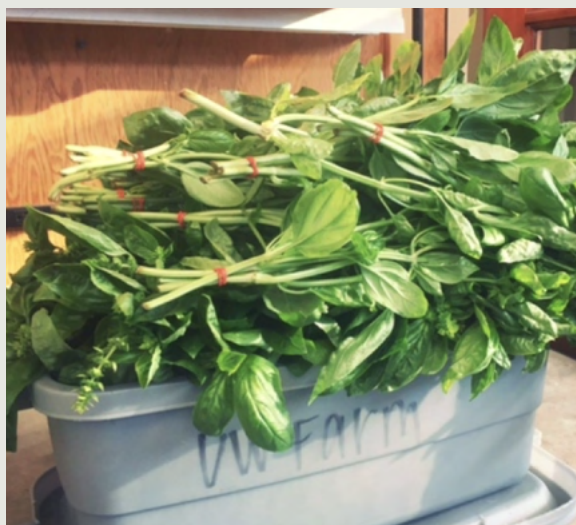
Herbs were the most sought after and highest revenue producing item purchased by HFS in 2018-19.