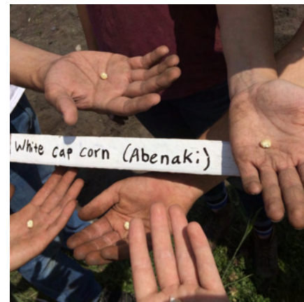
White cap or Abenaki corn, a cold-hardy and resilient variety from the Koasek Nation in the Northeast.