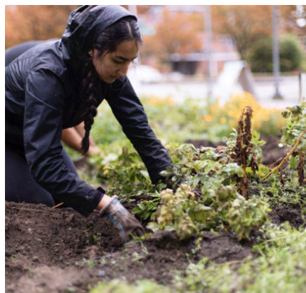
Planting of Ozette potatoes, a staple of the Makah Nation, who named it after one of their five villages near Neah Bay.