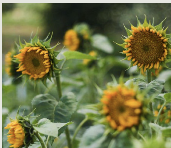
HFS purchased 3,105 flower stems from 2018-19.