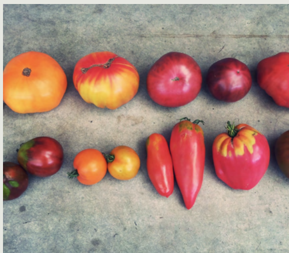
Tomatoes were the farm's highest revenue source in 2018.