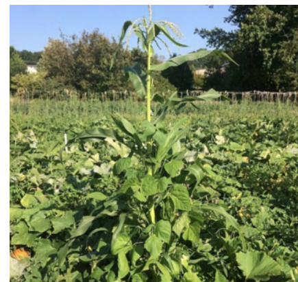
The "Three Sisters": a companion planting technique where corn, beans and squash are grown together.