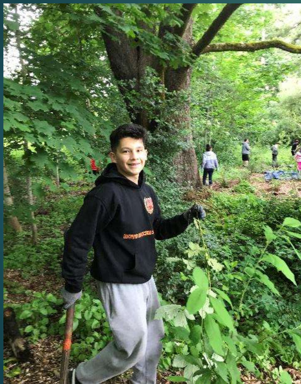
Morrill Meadows Park