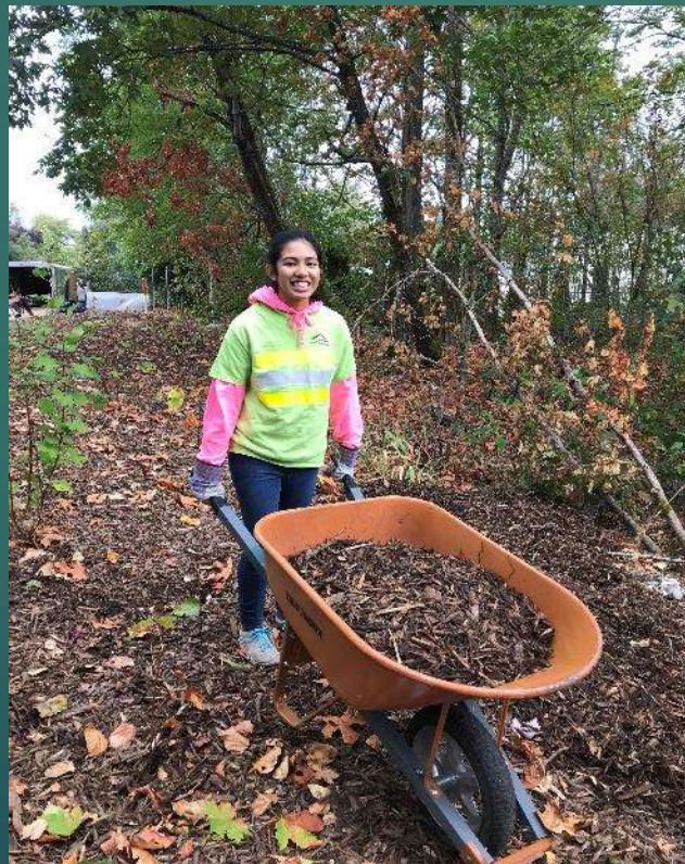
North Meridian Park