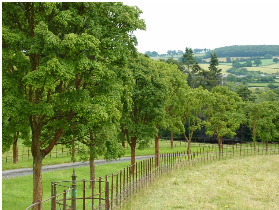
The Acer Griseum allée at Hergest Croft.

touring their remarkable collections (and even looking at more than maples!).