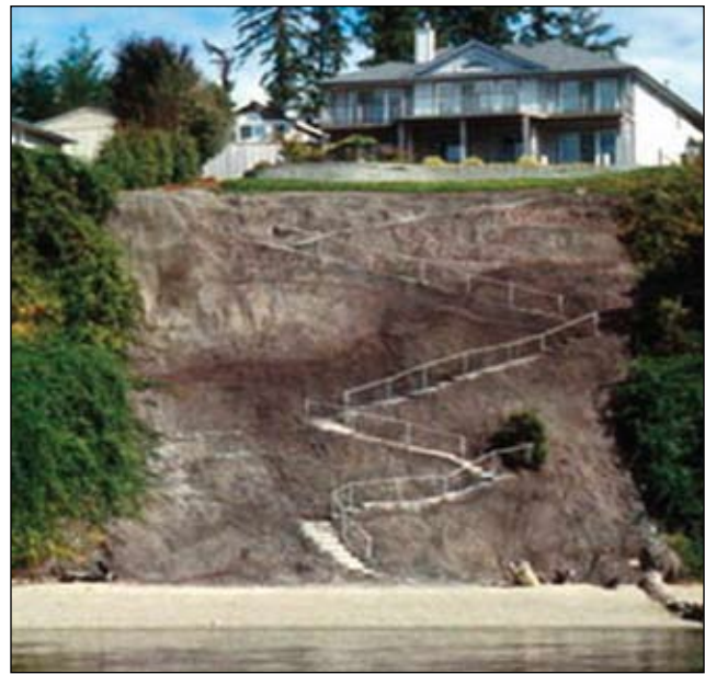
Figure 4. Examples of anthropogenic disturbances that result in changes (left) or elimination (right) of natural vegetation on shorelines.

based upon evaluation of 11 major deltas in Puget Sound indicate at least a 76 percent loss in tidal marshes and riparian habitat (Levings and Thom 1994). Coastal urban areas have lost 90-98 percent of their estuarine wetlands, and water quality is in good condition in only 35 percent of Washington's estuaries (WDNR 1998). The WDNR's ShoreZone inventory (WDNR 1999) indicates that riparian vegetation overhanging the intertidal zone is relatively rare in Puget Sound, occurring at only 440 of the nearly 2,500 shoreline miles of Puget Sound (Redman et al. 2005). Riparian forests were the first areas to be extensively logged, because they were easily accessed, and logs could be rafted and floated to mills around the region. Since mature hemlock/Douglas fir forests take hundreds of years to develop, it is likely that where these forests occurred naturally, there are few, if any, nearshore riparian forests remaining in pristine condition, with the possible exception of areas where natural disturbance was frequent and persistent enough to maintain early seral communities. Therefore, it is logical to assume that altering the vegetation structure and disrupting natural processes has resulted in a shift in or loss of riparian vegetation, community types, and ecological functions.