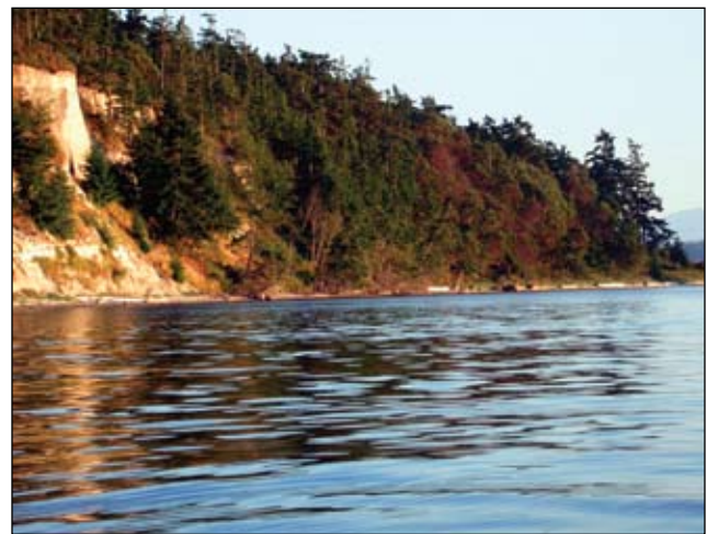
Figure 2. Photos depicting natural erosion (left) and vegetation patterns (right) on a steep bluff.